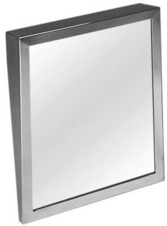
M4300 / M4400 Fixed Tilt Mirrors