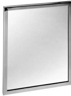
M1100/1200 Angle Frame Mirrors

To see Meek's other mirror styles , shelves and restroom accessories visit our website!