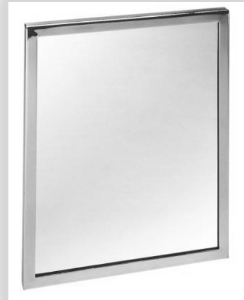
M1100/1200 Angle Frame Mirrors