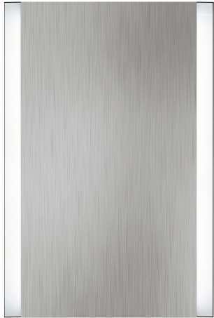
M2011, M4011, M3010, M1011 LED Lighted Backlit Mirrors