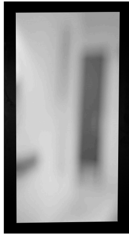
M1400TS/M1400TRIBL Wood Frame Mirrors

To see Meek's other mirror styles , shelves and restroom accessories visit our website!